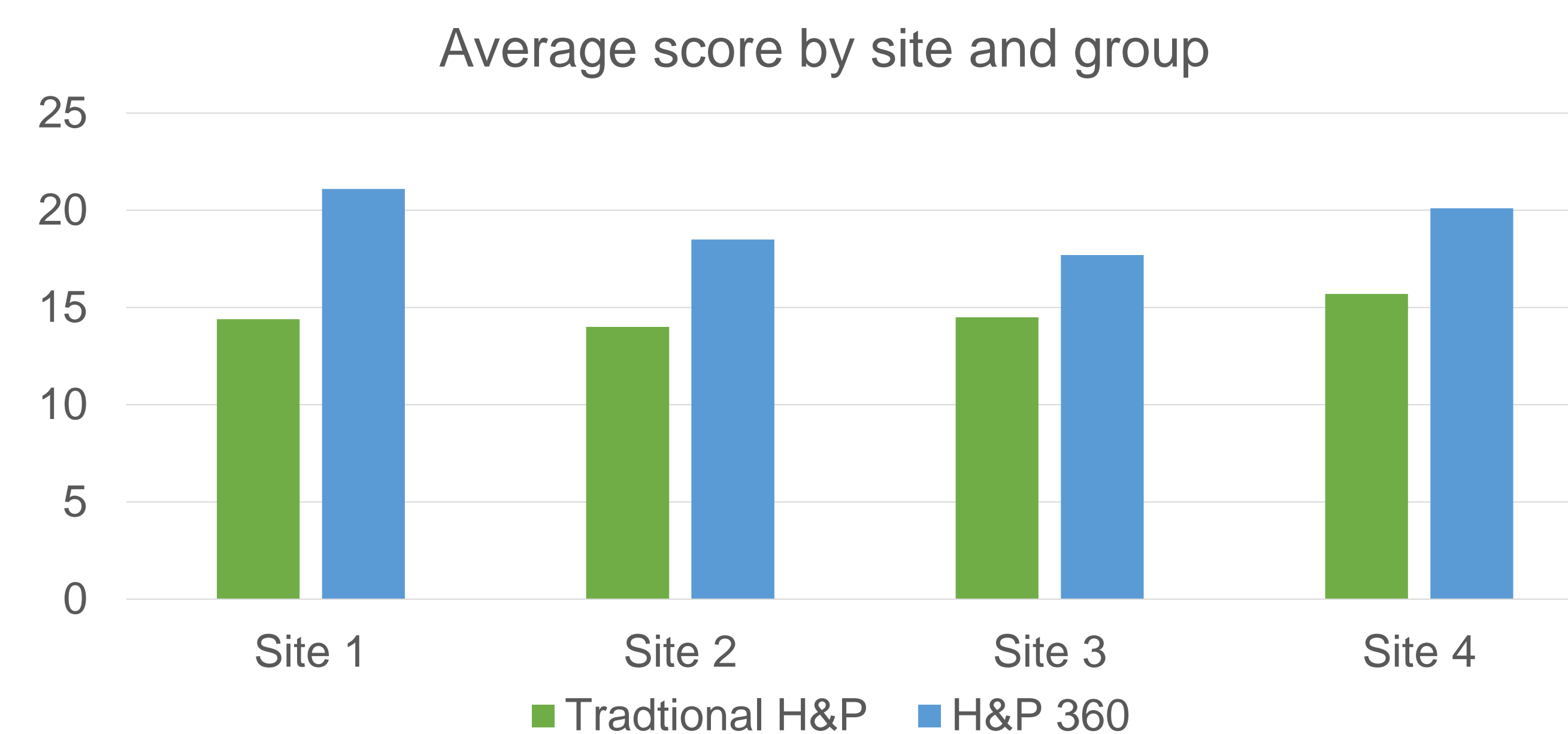
Table 1. Total average score by site and group (max score: 24)